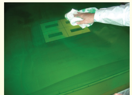
Step 3 . Use rags or towels to wipe up ink residue. Re-apply to clean up ink residue in image area.