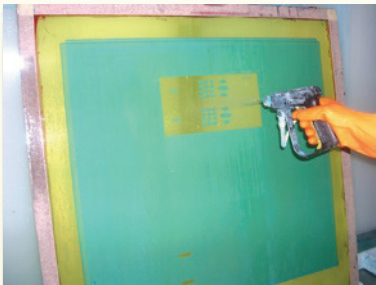
Step 1. After removal of ink, blockout, and tape, apply CSR/30 to a wet screen (both sides).

CSR/30 can be applied by a sponge, pad, spray bottle, dip tank, or pneumatic pump systems.