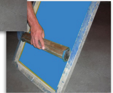
Step 2) Squeegee Side