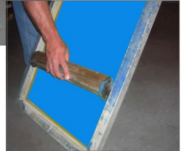
Step 2. Squeegee Side