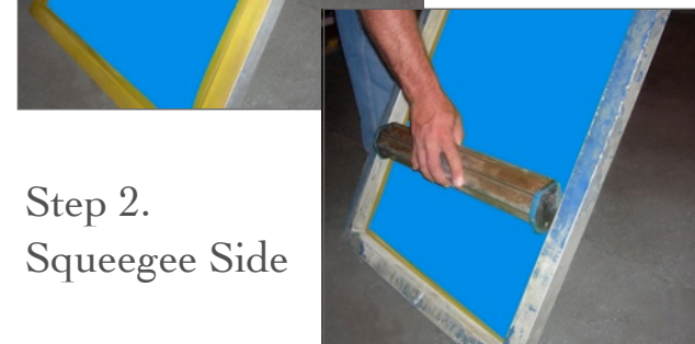
Step 2. Squeegee Side