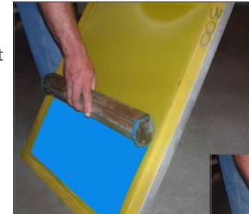
Step 1. Print Side

Note: Above times are based on using a screen coated 2/2.