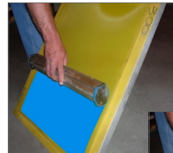
Step 1. Print Side

Note: Above times are based on using a screen coated 2/2.