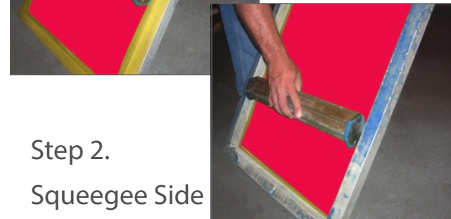
Step 2. Squeegee Side