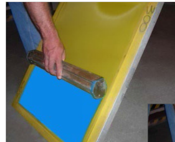
Step 1. Print Side

Note: Above times are based on using a screen coated 2/2.