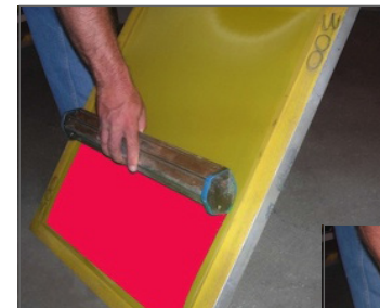
Step 1. Print Side

Note: Above times are based on using a screen coated 2/2.