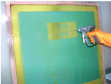
Step 1. After removal of ink, block-out, and tape, apply Eco-Strip® Part B to a wet screen (both sides).

Eco-Strip® Part B can be applied by a sponge, pad, spray bottle, dip tank, or pneumatic pump systems.