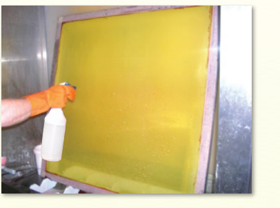
1)After removal of ink, block-out, and emulsion, apply ENVIROCLEAN® to the screen(both sides).