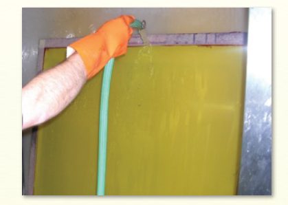
3. Flood rinse the screen starting at the top and washing all residue off the screen.

Look For More Information on all the Products in the EnviroLine (8) of "Green" Chemistry.