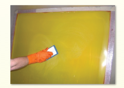
2. Scrub screen with non-abrasive pad or brush. Let dwell 1-2 minutes.