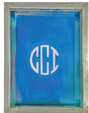
Step 4. End Result