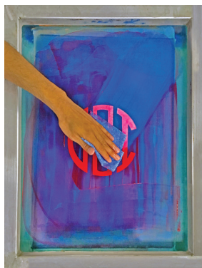
Step 2. Apply envirowipes to both side of screen