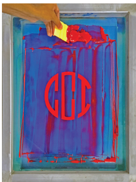
Step 1. Card excess ink from screen