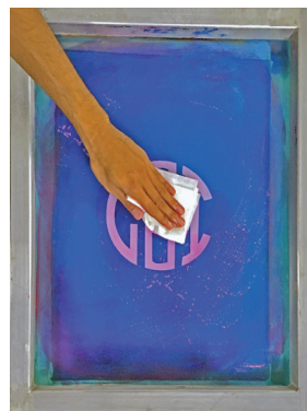
Step 3. Wipe away remaining residue with paper towel