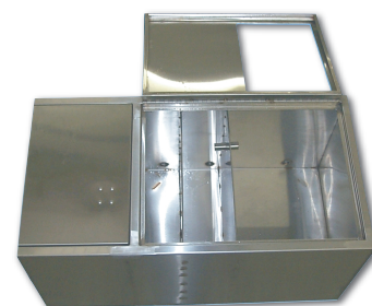
30 Gallon Tank w/Tank Separator