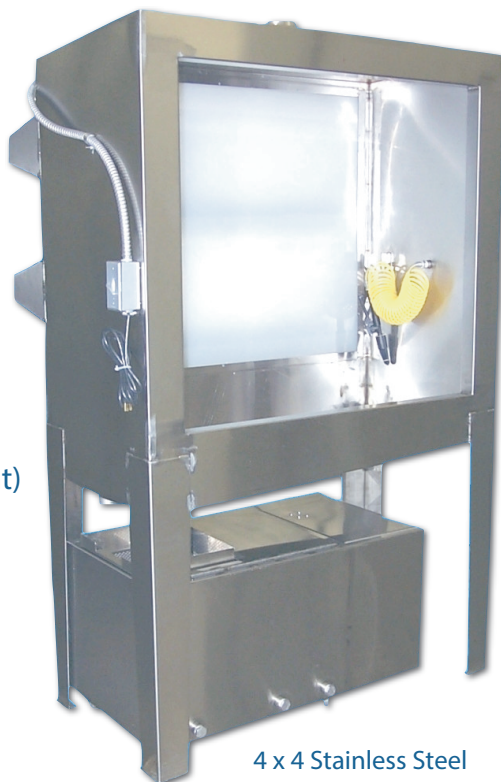
4 x 4 Stainless Steel w/Backlighting