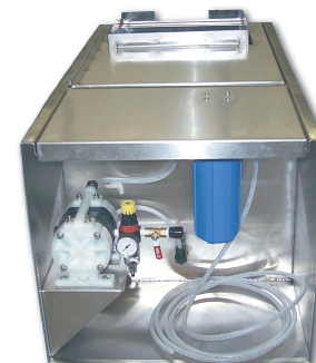
Air Operated Pump and 10" Filter Cartridge