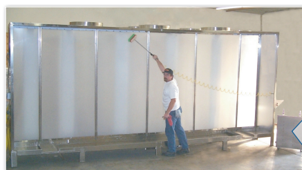
16 x 8 Custom Stainless Steel w/Backlighting, Dual Tank System