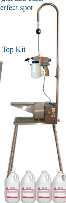
TT-250 Leg and Arm Kit, 4 x1 gal. case SR-97, SG-5000 Gun