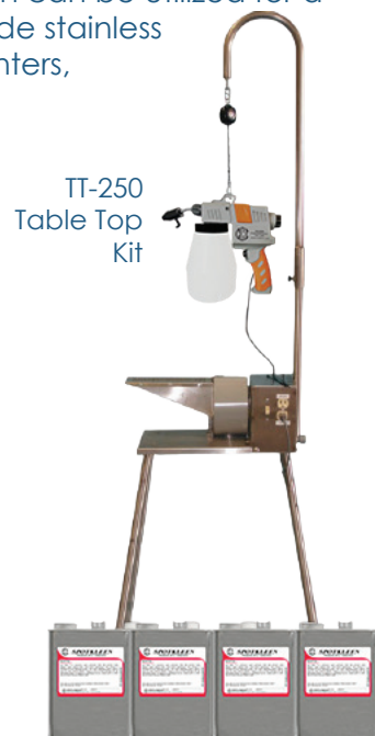
TT-250 Table Top Kit