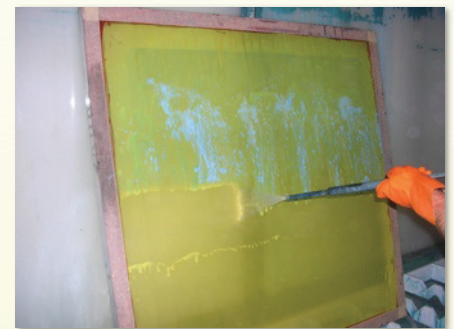
Step 3. High pressure rinse - starting at bottom.