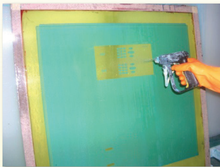
Step 1. After removal of ink, block-out, and tape, apply ER/30 to a wet screen (both sides).

ER/30 can be applied by a sponge, pad, spray bottle, or pneumatic pump systems.