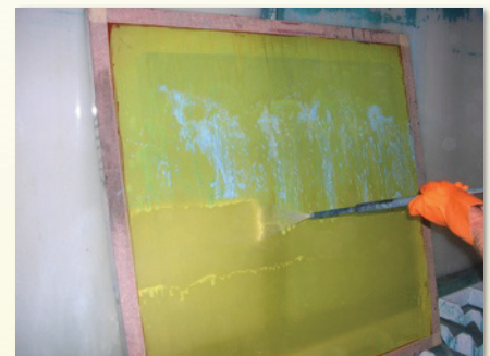
Step 3. High pressure rinse - starting at bottom.