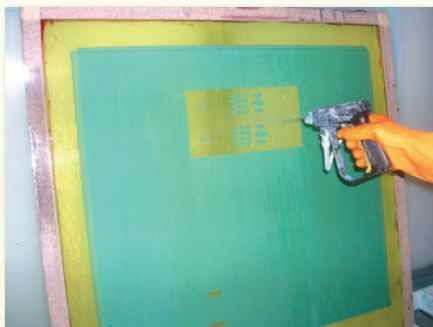
Step 1. After removal of ink, block-out, and tape, apply ER/30s to a wet screen (both sides).

Emulsions, that are not properly broken down, will leave excessive residue on the mesh.