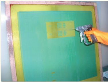
Step 1. After removal of ink, block-out, and tape, apply ER/80 to a wet screen (both sides).

ER/80 can be applied by a sponge, pad, spray bottle, dip tank, or pneumatic pump systems.