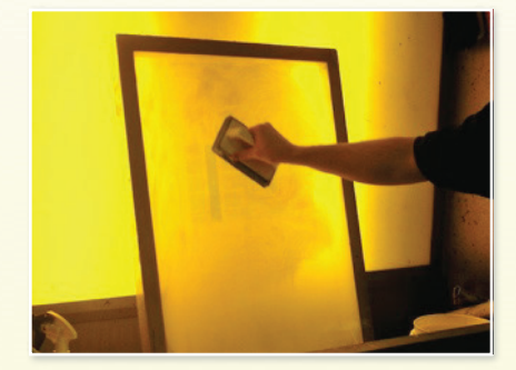
Step 2. Scrub screen with non-abrasive pad or brush. Allow screen to sit for up to 10 minutes.