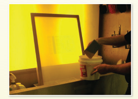
Step 1. Apply GB-1000 to both sides of the screen.