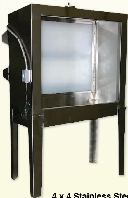
4 x 4 Stainless Steel Washout Booth

Always card excessive ink from screen. Use one of the following applications.