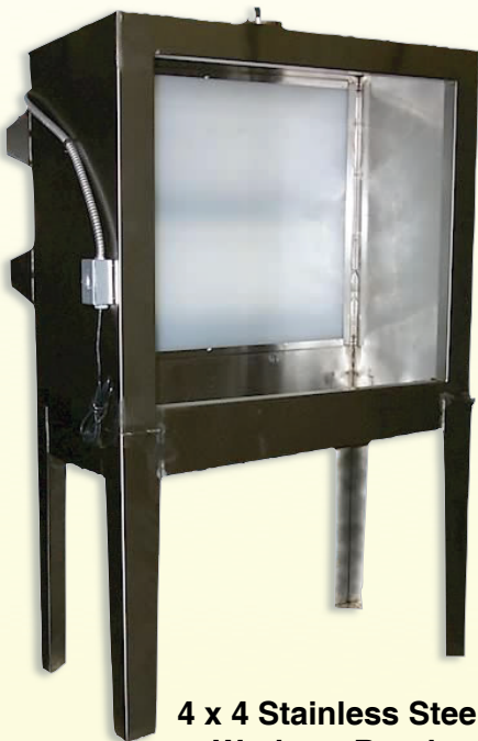
4 x 4 Stainless Steel Washout Booth

Always card excessive ink from screen. Use one of the following applications.