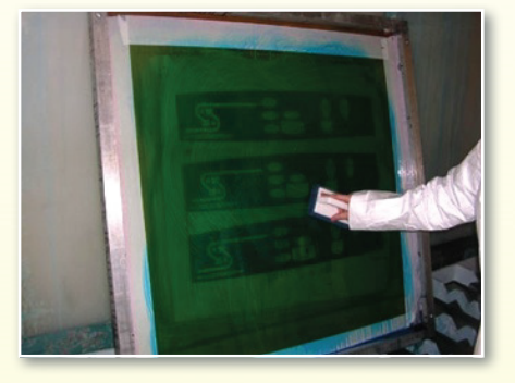
Step 2. Scrub screen with a non-abrasive pad or brush until all ink is completely liquified.