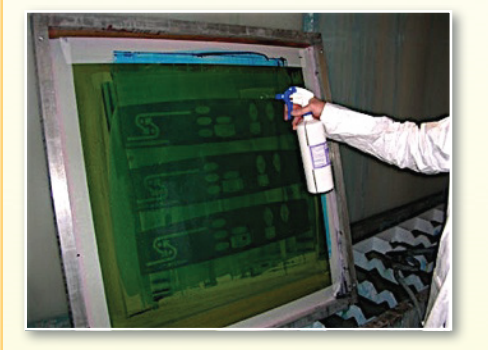
Step 1. Spray GR-7 on both sides of the screen.