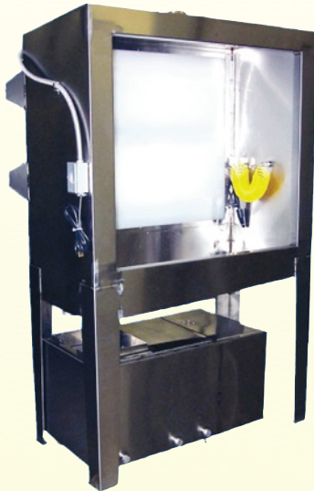
4 x 4 Stainless Steel Recirculating Booth

Always card excessive ink from screen. Use one of the following applications.