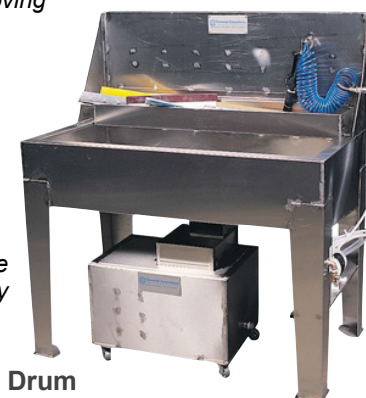
SQ-1000 Squeegee Cleaner

After ink and emulsion has been removed, spray IW-26 on both sides of the screen. Scrub screen both sides with a non-abrasive brush or pad. Allow product to dwell a few minutes (depending on severity of stain). High pressure rinse screen working from bottom and moving upwards.