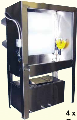
4 x 4 Stainless Steel Recirculating Booth

Always card excessive ink from screen. Use one of the following applications.