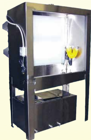
4 x 4 Stainless Steel Recirculating Booth