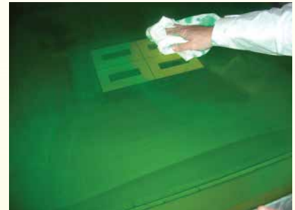
Step 3. Use rags or towels to wipe up ink residue. Re-apply to clean up ink residue in image area.