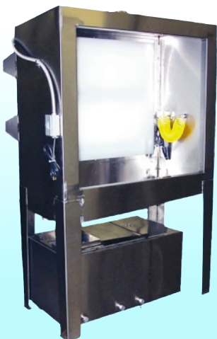
4 x 4 Stainless Steel Recirculating Booth

This will prevent ink from locking back onto the mesh when coming in contact with the rinse water.