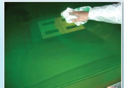
Step 3 . Use rags or towels to wipe up ink residue. Re-apply to clean up ink residue in image area.