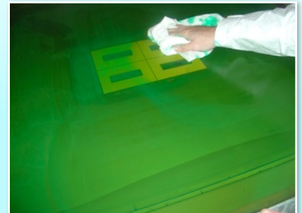
Step 3. Use rags or towels to wipe up ink residue. Re-apply to clean up ink residue in image area.