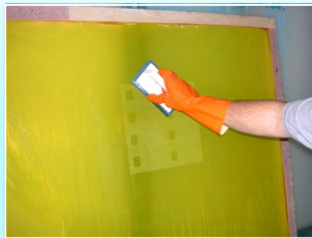
Step 2. Scrub screen with non-abrasive pad or brush. Allow screen to dwell up to 10 minutes.