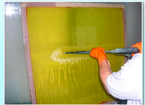
Step 3. High pressure rinse - starting at bottom.