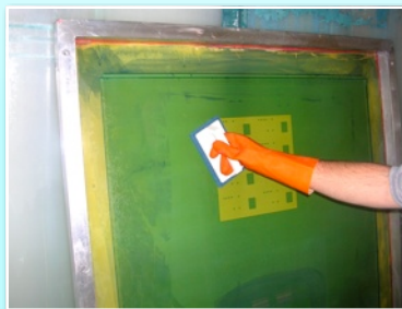
Step 2. Scrub screen with non-abrasive pad or brush. Allow to dwell for 1-3 minutes.