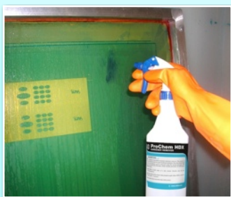
Step 1. Apply HDX on both sides of dry screen.