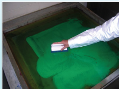
Step 2. Scrub ink with a non-absorbent pad until liquified.