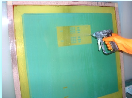
Step 1. After removal of ink, block-out, and tape, apply Pro Strip solution to a wet screen(both sides).

Emulsions, that are not properly broken down, will leave excessive residue on the mesh.