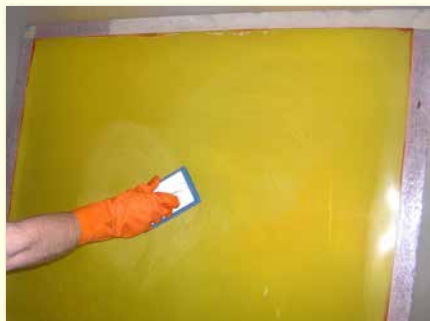
Step 2. Scrub screen with non-abrasive pad or brush.