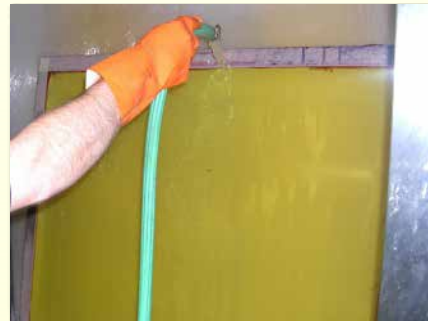
Step 3. Flood rinse the screen starting at the top and washing all residue off the screen.