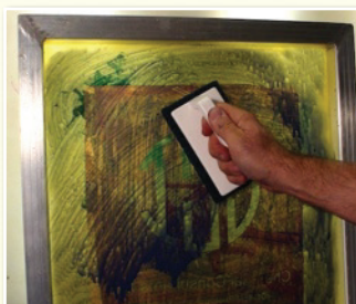
Step 2. Scrub screen with non-abrasive pad or brush.