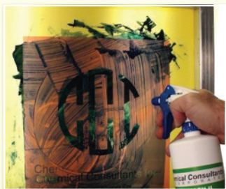
Step 1. After removal of ink, and tape, apply Strip N Clean Solution to a wet screen(both sides).

STRIP N CLEAN can be applied by a sponge, pad, spray bottle, dip tank, or pneumatic pump systems.