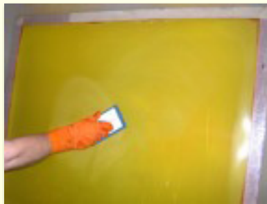
2. Scrub screen with non-abrasive pad or brush.