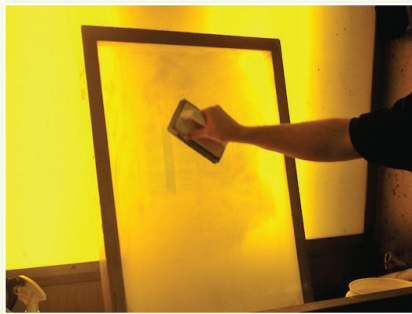
Step 2. Scrub screen with non-abrasive pad or brush. Allow screen to sit for up to 10 minutes.