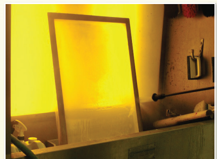
Step 3. High pressure rinse - starting at bottom.