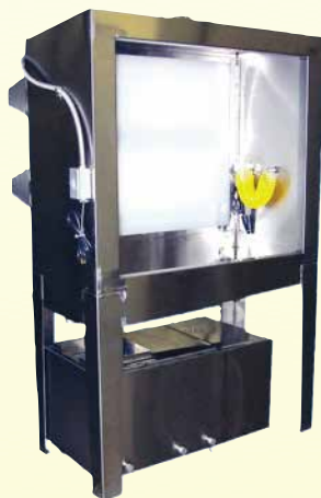
4 x 4 Stainless Steel Recirculating Booth

This will prevent ink from locking back onto the mesh when coming in contact with the rinse water.